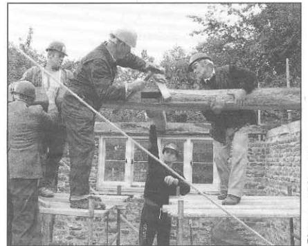
The 16th century timber-framed cross-wing of Longport House takes shape on its new site