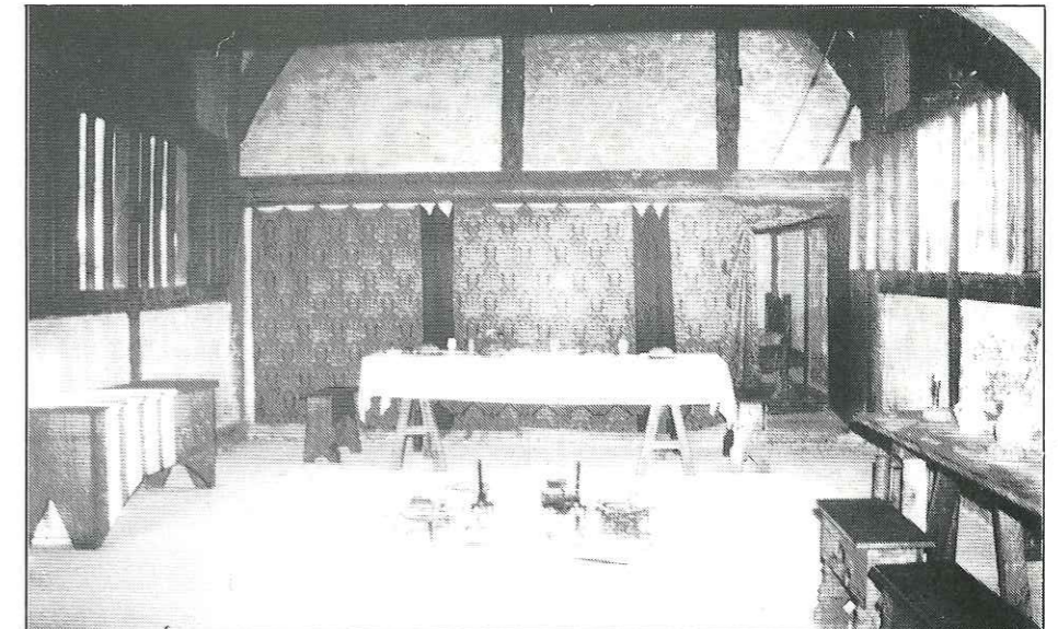
The hall at Bayleaf Farmhouse, furnished as it would have been in medieval times.

The practical operation of Bayleaf Farmstead as a historical unit has been most encouraging. Next season an audio tape system and a booklet supporting the exhibition will be available to visitors wanting further information about the Farmstead, and new items will continue to be introduced periodically.