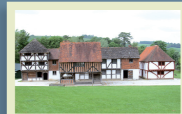
26 Market hall from Titchfield