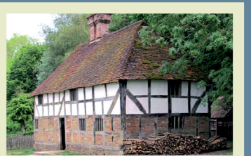
18 'Pendean': farmhouse