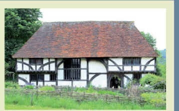
12 'Bayleaf': Wealden house