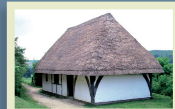
19 Hall from Boarhunt