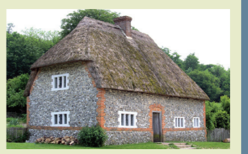
4 House from Walderton