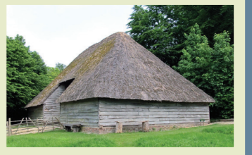
2 Barn from Hambrook