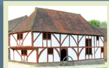
29 House from North Cray