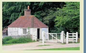
3 Toll house from Beeding