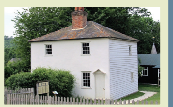
5 'Whittaker's Cottages'