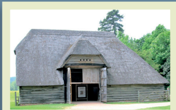
44 'Court Barn'