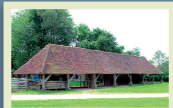
38 Brick drying shed