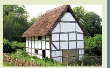
7 'Poplar cottage'