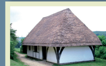
19 Hall from Boarhunt