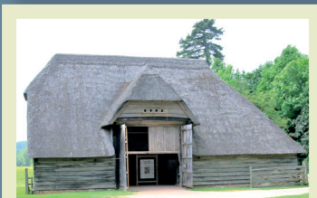
44 'Court Barn'