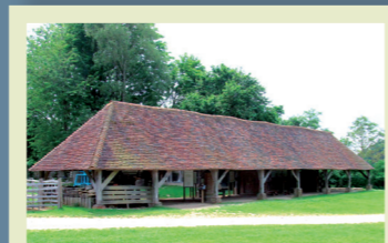
38 Brick drying shed