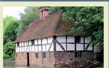
18 'Pendeau': farmhouse