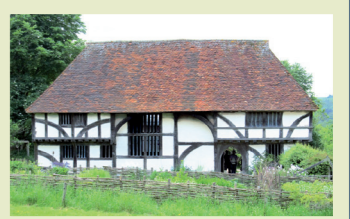
12 'Bayleaf': Wealden house