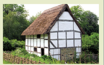
7 'Poplar cottage'