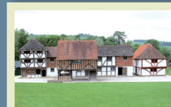
26 Market hall from Titchfield